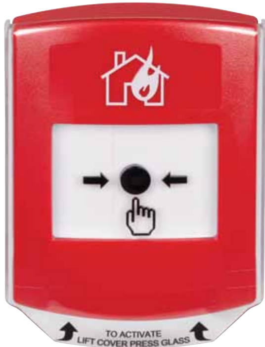
Red Global ReSet